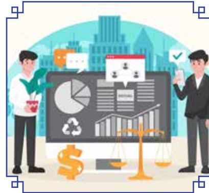
WSBP berhasil mencapai kesepakatan Restrukturisasi Keuangan dengan seluruh kreditur melalui Perjanjian Perdamaian yang disahkan lewat Putusan Pengadilan Niaga pada Pengadilan Negeri Jakarta Pusat No. 497/Pdt.Sus-PKPU/2021/PN.Niaga.Jkt.Pst (homologasi) pada 28 Juni 2022. WSBP succeeded in reaching a Financial Restructuring agreement with all creditors through a Peace Agreement ratified through a Commercial Court Decision at the Central Jakarta District Court No. 497/Pdt.Sus-PKPU/2021/PN. Niaga.Jkt.Pst (homologation) on June 28, 2022.