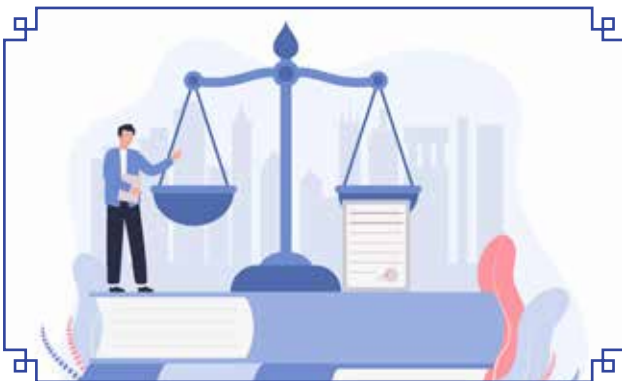
Mahkamah Agung mengeluarkan putusan "Tolak" atas gugatan Kasasi yang diajukan oleh salah satu kreditur PKPU WSBP. Seiring dengan putusan Tolak tersebut, maka Perjanjian Perdamaian WSBP dinyatakan berkekuatan hukum tetap ( inkracht ).