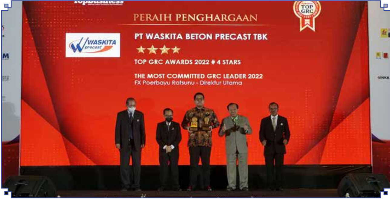
WSBP bersama PT Waskita Karya (Persero) Tbk meraih 4 (empat) penghargaan pada ajang Top GRC Awards 2022, Selasa 8 September 2022, di Jakarta dengan tema "GRC Empowerment in Digital Era and Its Support to G20 Indonesia Presidency".