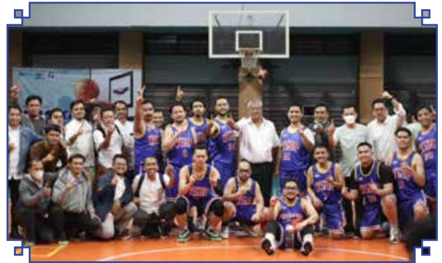
Tim Basket WSBP berhasil meraih juara 1 dalam ajang Waskita Basketball 2022.

WSBP held an Inauguration of Structural Officers, on August 22, 2022 at WSBP Head Office. This event was attended by Board of Director, Vice President, and Manager of WSBP.