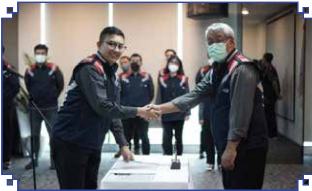
WSBP mengadakan Pelantikan Pejabat Struktural, pada 22 Agustus 2022 di Kantor Pusat WSBP. Acara ini dihadiri oleh Board of Director, Vice President, dan Manager WSBP.

WSBP held an Inauguration of Structural Officers, on August 22, 2022 at WSBP Head Office. This event was attended by Board of Director, Vice President, and Manager of WSBP.