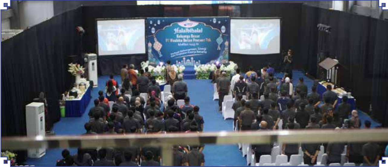
WSBP menggelar acara Halal Bihalal Hari Raya Idul Fitri 1443 H pada 9 Mei 2022 di di Learning Center Karawang, Jawa Barat. Acara yang dihadiri oleh Board of Commissioner dan Board of Director WSBP merupakan ajang silaturahmi antar pegawai WSBP. WSBP held Halal Bihalal event for Eid al-Fitr 1443 H on May 9, 2022 in Learning Center Karawang, West Java. The event which was attended by WSBP Board of Commissioners and Board of Directors is a gathering event for WSBP employees.